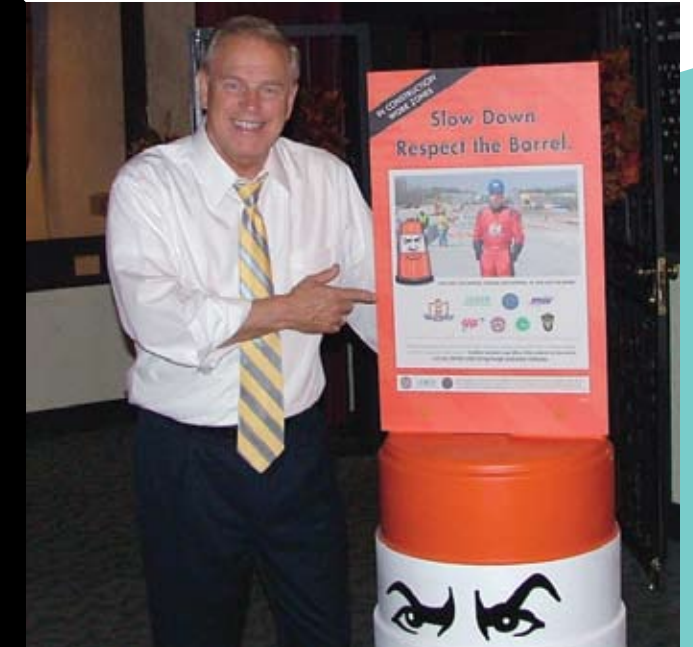
ABOVE: Bud the Barrel is making friends, pictured here with Ohio Governor Ted Strickland at an Ohio Laborers' District Council Retreat held at Shawnee State Lodge in Portsmouth, Ohio.